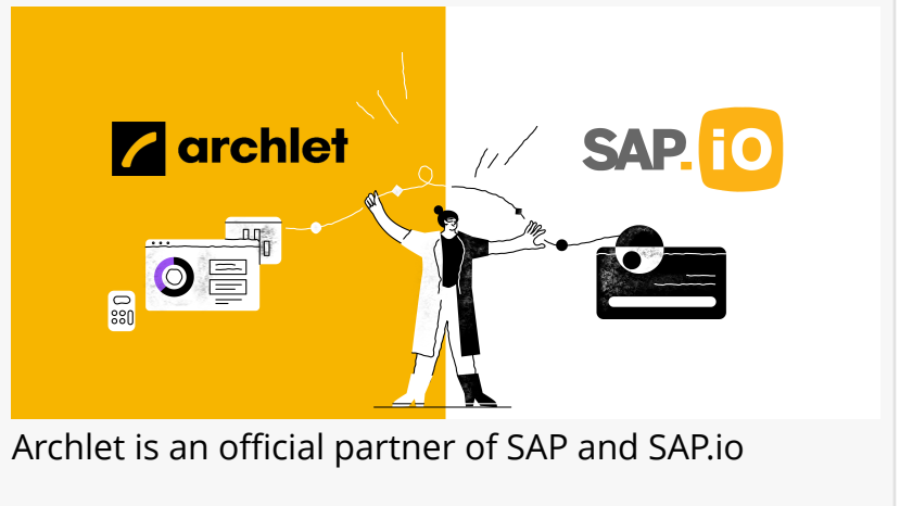
Archlet is an official partner of SAP and SAP.io

The API connector integrates with SAP® Ariba® solutions and enables advanced sourcing analytics and scenario optimization capabilities for customers.