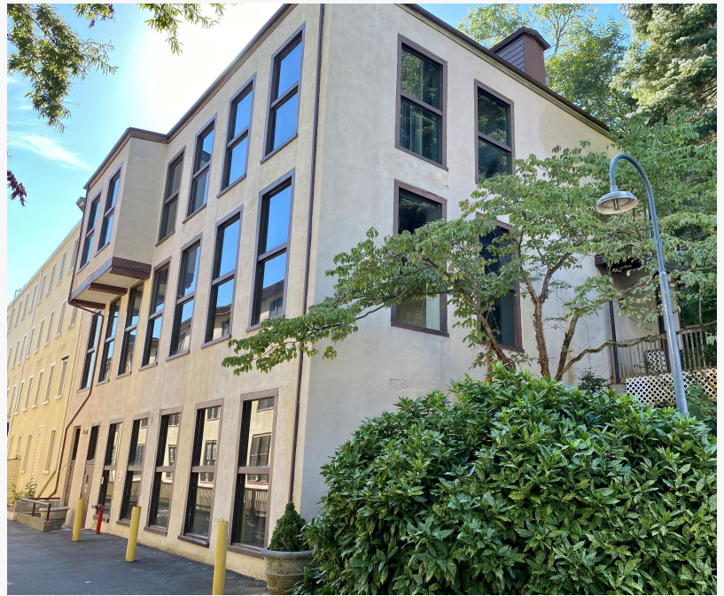
30 Bancroft Mills Rd, Wilmington DE

WILMINGTON, DELAWARE, USA, October 13, 2021 /EINPresswire.com/ -- Max Spann Real Estate & Auction Co is pleased to announce the upcoming Auction of a 7,989+/-SF three-story office building, built in 1907. The building is situated on 0.24+/- acres in the Waterfront District (W-4) and comes with 24 deeded parking spots. The property is located along the scenic Brandywine River across the bridge from Alapocas Run State Park and within walking distance to Rockford Park, the Delaware Art Museum, shopping, and restaurants.