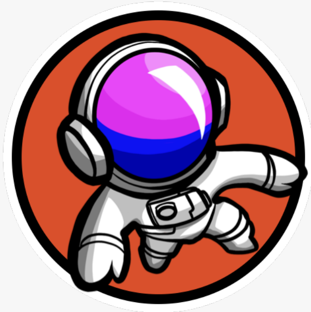
Mars Dollar Token

/EINPresswire.com/ -- Entrepreneurs like billionaire Elon Musk are ready to colonize the Red Planet and enlightened financial experts like the developers of the Mars Dollar Token , will plant a flag for the dominant medium of exchange. This intuitive token system is a well-planned approach to a celestial payment system connecting both planets. Though colonization may be light-years away, the forward-thinking creators of the Mars Dollar Token ( $MDT ) are positioned to be the pillar of the Mars financial infrastructure. Based on the ideals of Bitcoin visionary Satoshi Nakamoto, $MDT “aims to be the interplanetary payment system for excellence.”