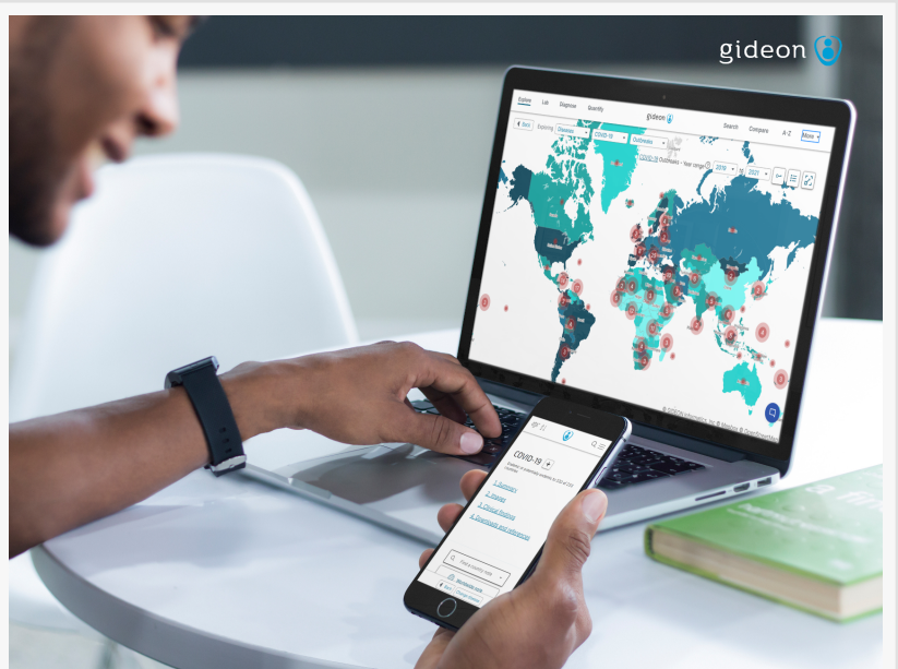
GIDEON application: COVID-19 outbreaks map and the main disease record

The GIDEON database identifies COVID-19 prevalence and seroprevalence data in real-time and collates all studies into interactive tables. Users can easily sort these data by city, percentage of prevalence vs. seroprevalence, and population sectors (healthcare workers, students, dialysis patients, and others). GIDEON now contains 1,000 COVID prevalence and seroprevalence surveys, from all reporting countries.