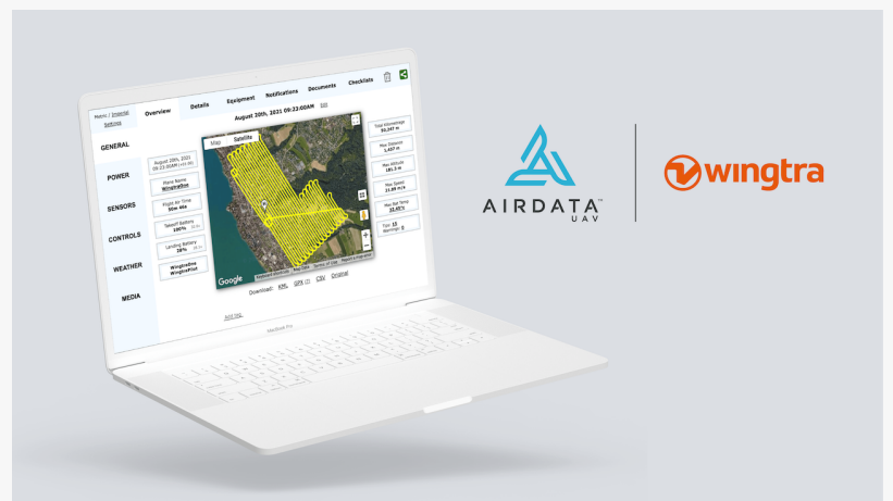
Airdata & Wingtra on Laptop