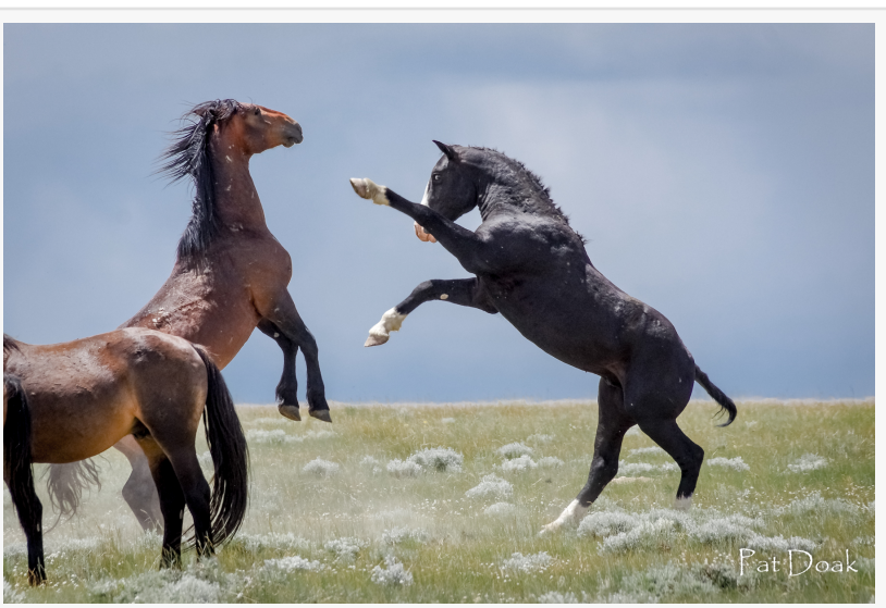
Wild horses in Wyoming

"America's wild horses are fighting their last stand," said Executive Producer Robert Redford. "Increasing competition for our natural resources threatens our wilderness areas, our wild horses and other wildlife species. Horses are interwoven into the very fabric of what is America. What threatens them threatens us all."