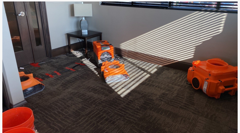
Water Damage equipment set up for dry out process.