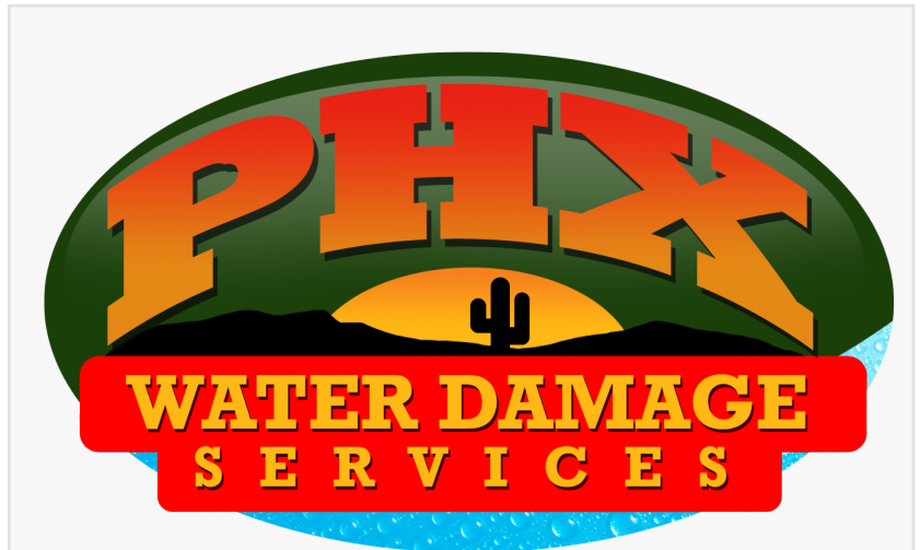
Phoenix Water Damage Services

4. Air Scrubbers: This piece of equipment removes odors, particles, and pollution from the air. Air scrubbers also make sure that no microbial growth starts to develop after water damage has