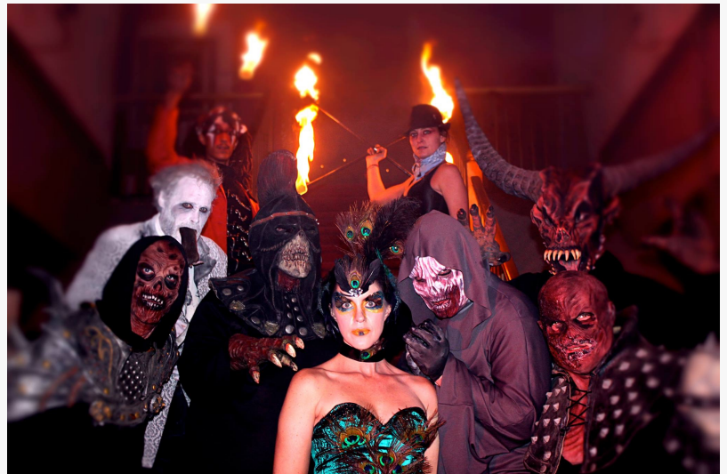
Queen of Haunts with Edge of Hell cast

KANSAS CITY, MISSOURI, UNITED STATES, October 15, 2021 /EINPresswire.com/ -- The West Bottoms District, just west of Kansas City's downtown, descended into blight with the diminished use of the historic stockyards and the catastrophic flood of 1951. This era, after the flood, generated naysayers who saw little value in the area, with their moans, growls, and boos. Ironically, as fate would have it, the decision in 1975 for the Edge of Hell Haunted House to move from the River Market to the West Bottoms was the beginning of the district's transformation to a welcome destination again.