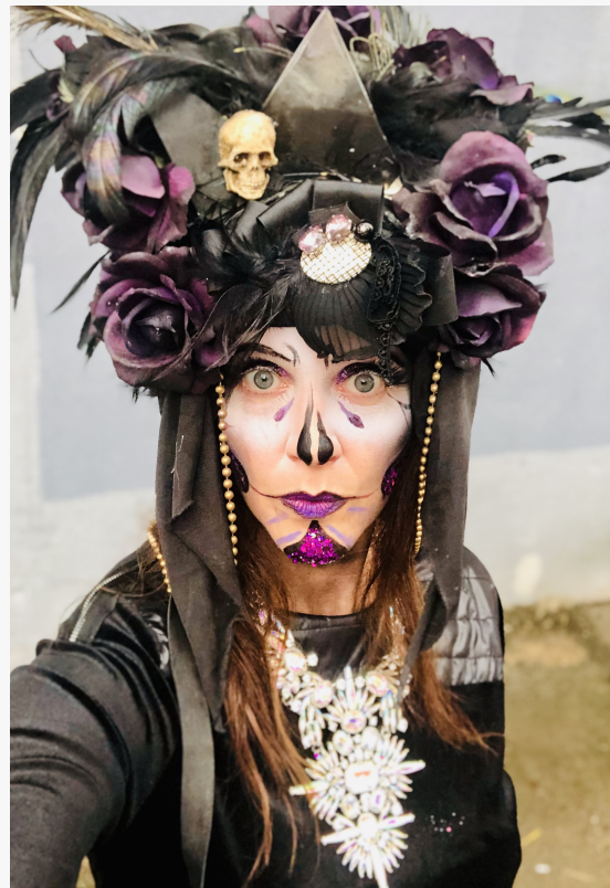
Queen of Haunts reigns the haunts: Edge of Hell, Beast, and Macabre Cinema

This press release can be viewed online at: https://www.einpresswire.com/article/553913594