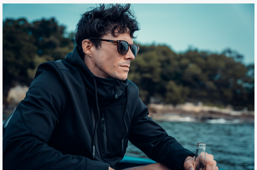
The Hoodie-X (male)