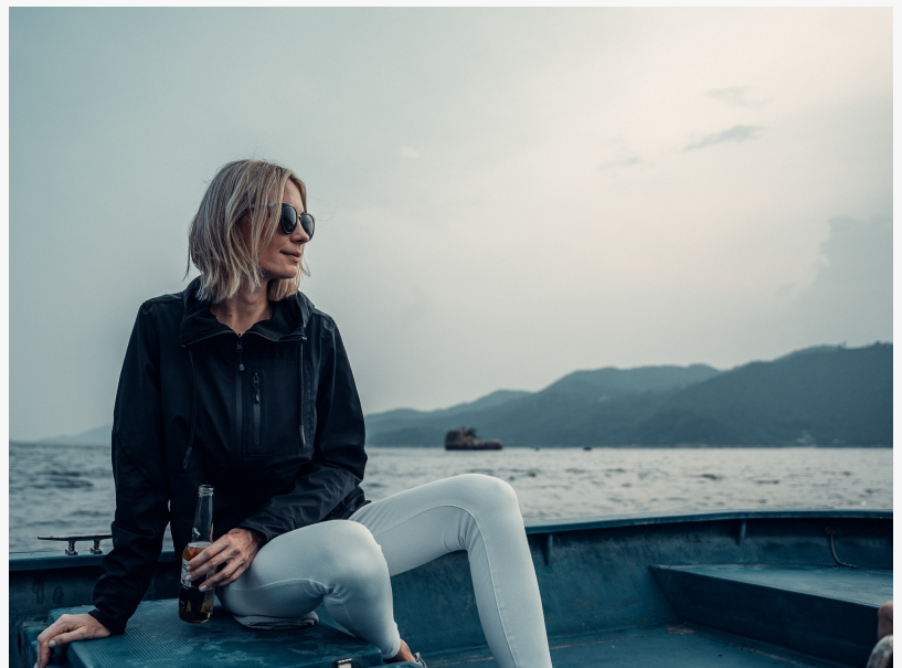
The Hoodie-X (women)