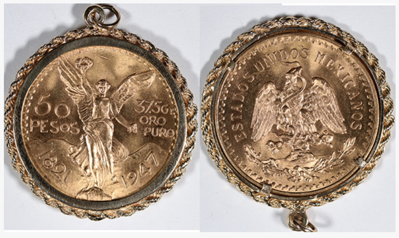
50-peso Mexican gold coin from 1947 (90 percent pure gold) with a 14-carat bezel (estimate: 2,600-$3,000).

$2,000-$2,500); and a pair of trays, one for Old Judge Whiskey (Rothenberg Co.) and one for Wieland's Beer (both San Francisco) (estimate: $1,000-$1,700).