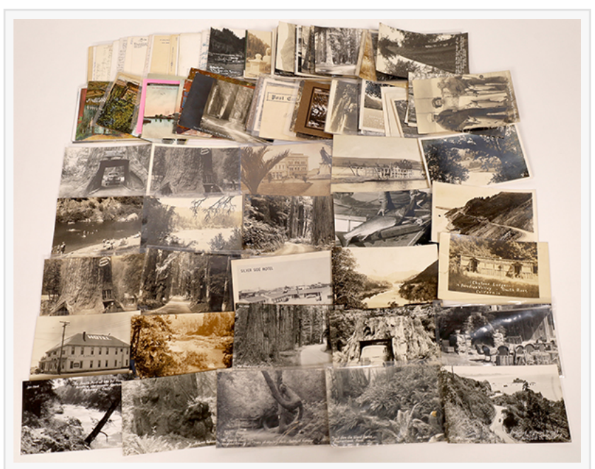
Collection of Humboldt and Del Norte counties (Calif.) postcards, showing the NorCal redwoods scenery along US 101, about 125 pieces (estimate: $300-$600).

Other Day 2 offerings will feature a Haag Bros. Circus poster (date unknown), printed on heavy canvas measuring 29 inches by 44 inches and boasting vibrant colors (estimate: $1,000-$4,000); a Civil War-era Bowie presentation knife made in Sheffield and used by the 9th Corp under Gen. Ambrose Burnside, acid etched "Victory to Our Brave Volunteers" (estimated: $2,000-$3,000); and a beautiful 14-18kt