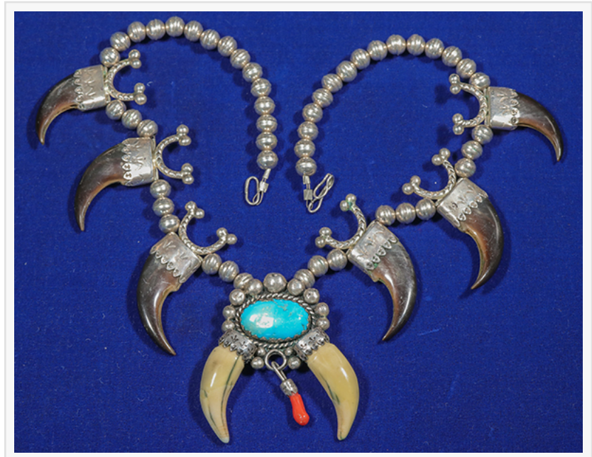
Hollow silver bead necklace with six bear claws capped with silver adornments, plus a central turquoise cabochon set in silver (estimate: $2,000-$4,000).

Also offered on Day 1 will be an interesting array of covers and letters addressed to Ruth Disney (Beecher), Walt Disney's sister; and to Elias Disney, Walt and Ruth's father – eight items in all, from 1918-1965 (estimate: