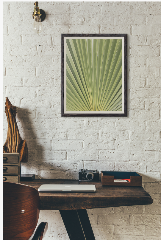
Shop office workspace interior

This press release can be viewed online at: https://www.einpresswire.com/article/553984870