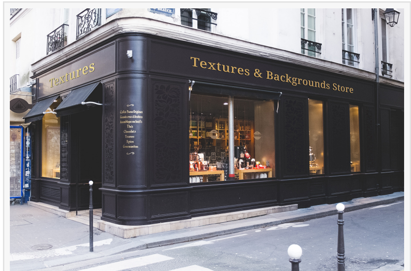
Textures and Backgrounds Store