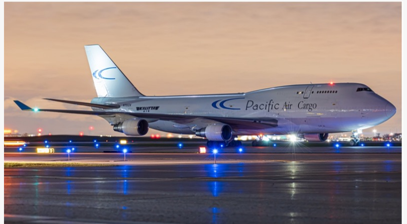
PAC B744F Aircraft Taxiing