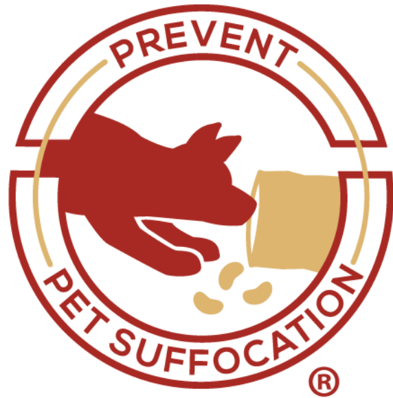
Prevent Pet Suffocation Logo

Chip bags and other food packaging pose serious suffocation risks to our pets. Too many pets, especially dogs, have died from suffocating in chip bags, cereal boxes, snack bags, pet treat bag liners, and pet food bags. A lot of these bags are made from a strong mylar-like material (like a balloon) which helps keep snacks fresher. When a curious dog puts his head into the bag looking for leftover crumbs, the bag creates a vacuum-like seal around the dog's neck. As he tries to breathe, the bag tightens, cutting off the oxygen. When a dog cannot remove the food bag from his head, he will usually start to panic, desperately running around until he collapses and dies from asphyxiation. This happens within minutes.