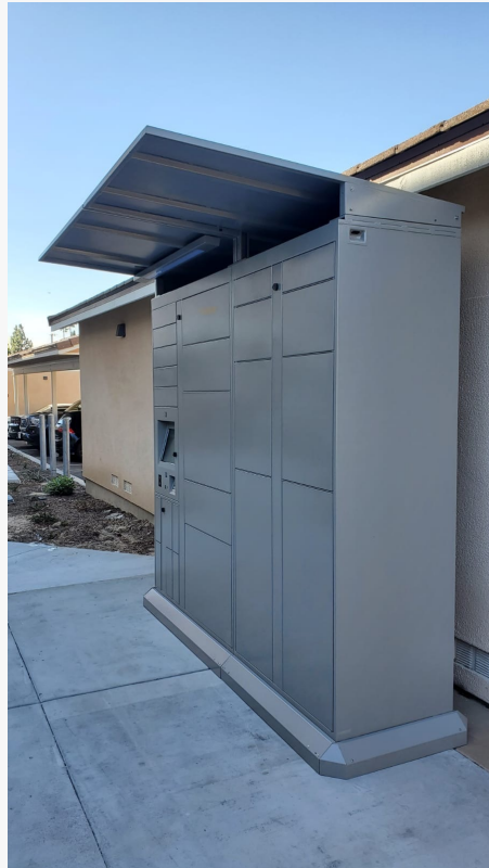
Package Nexus Parcel Lockers for Apartments

The newest Smart parcel lockers are created from the ground up with patented technologies that streamlines dropping off and picking up parcels. They also improve reliability and keep packages secure while awaiting pickup. Once the delivery company places the parcel into the smart parcel locker, the system sends a customizable notification that the recipient has received a delivery.