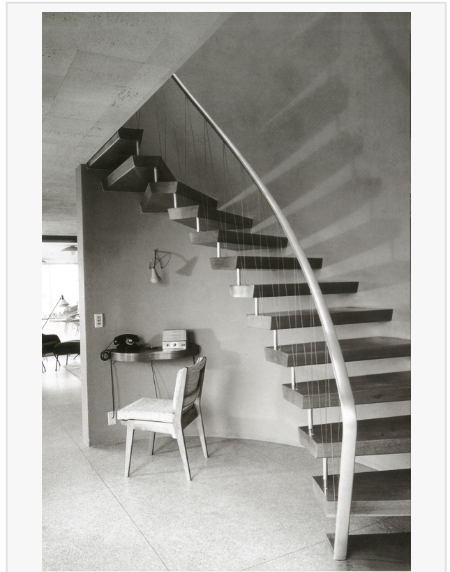
Hiss House Stair