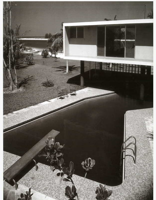
Hiss House Pool