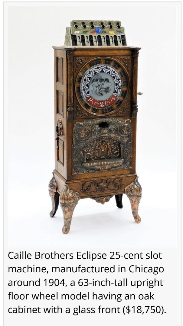
Caille Brothers Eclipse 25-cent slot machine, manufactured in Chicago around 1904, a 63-inch-tall upright floor wheel model having an oak cabinet with a glass front ($18,750).

Travis Landry Bruneau & Co. Auctioneers +1 401-533-9980 email us here