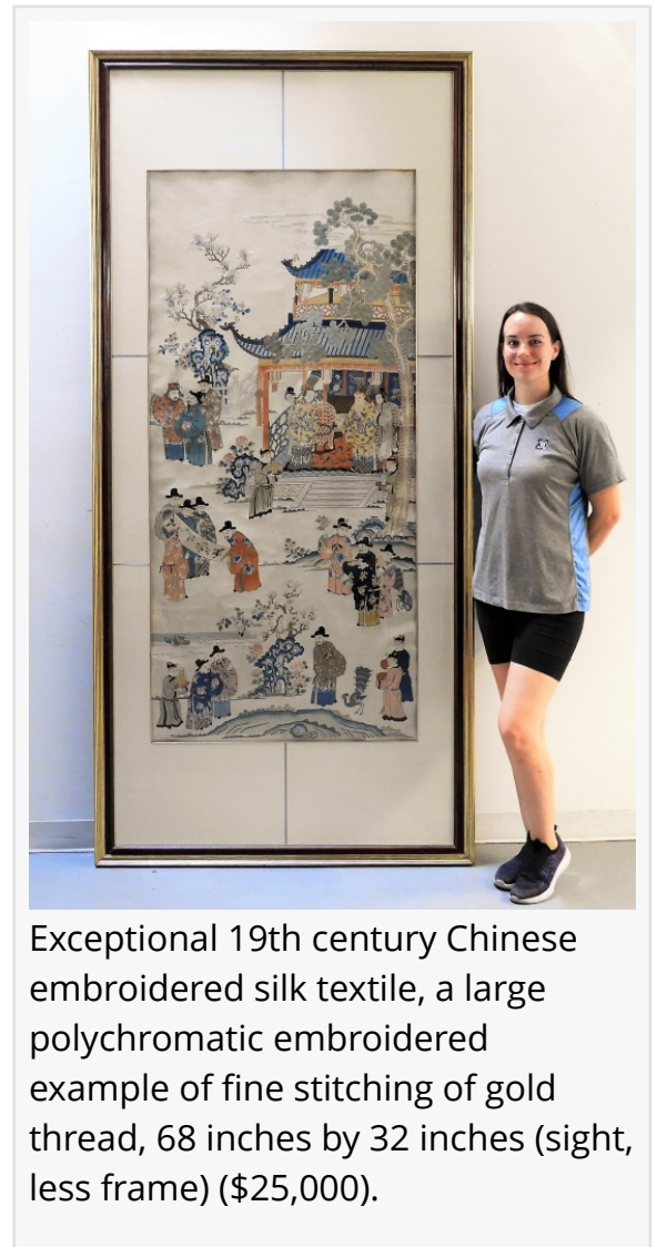
Exceptional 19th century Chinese embroidered silk textile, a large polychromatic embroidered example of fine stitching of gold thread, 68 inches by 32 inches (sight, less frame) ($25,000).

An O. D. Jennings Chief silver dollar slot machine (Chicago, 20th century), about 26 inches tall, featuring a wood and metal cabinet painted with pale yellow and gold glitter and decorated with the side profile of a Native American man, came out of a Cranston collection to ring up $6,875.