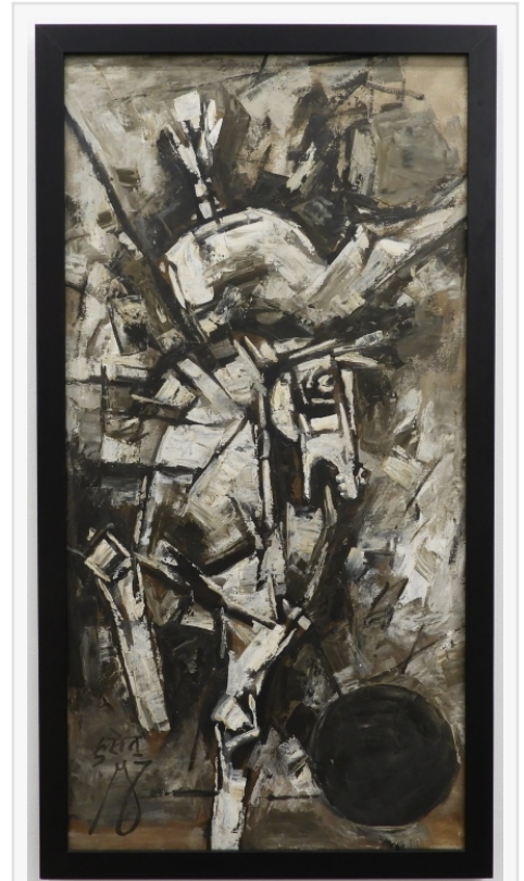
The sale's top lot was this dynamic oil on canvas Cubist horse painting by the Indian artist Maqbool Fida Husain (1915-2011), 46 inches by 24 inches (sight, less frame) ($43,750).

An exceptional 19th century Chinese embroidered silk textile, a large polychromatic embroidered silk example of the finest stitching of gold thread, 68 inches by 32 inches (sight, less frame), rose to $25,000. The textile, which utilized forbidden stitch, depicted men, women and peacocks in a garden over white silk. It had previously been in the collection of a prominent Cranston estate.