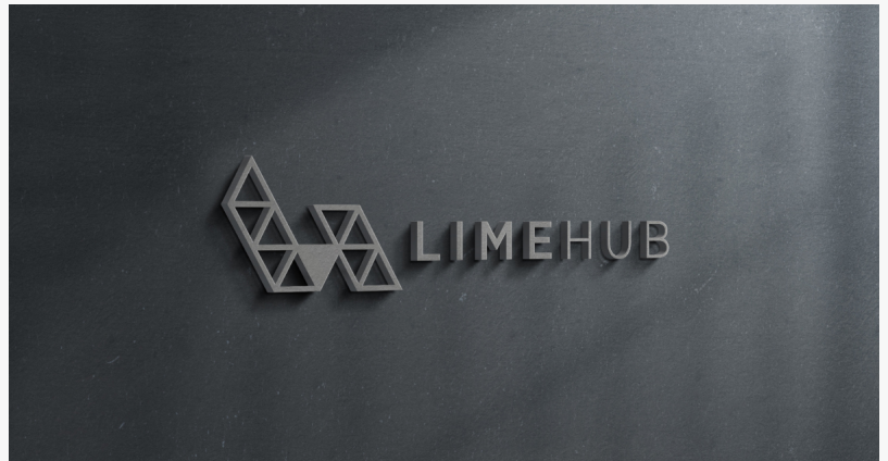
LimeHub Marketing Agency

"We have seen a massive increase in interest in Webflow recently. Businesses are simply fed up with outdated systems that have poor user experiences, limitations in functionality and design and are time-consuming and costly to maintain. Many are approaching us enquiring about Webflow specifically which is a testament to its reputation and capabilities."