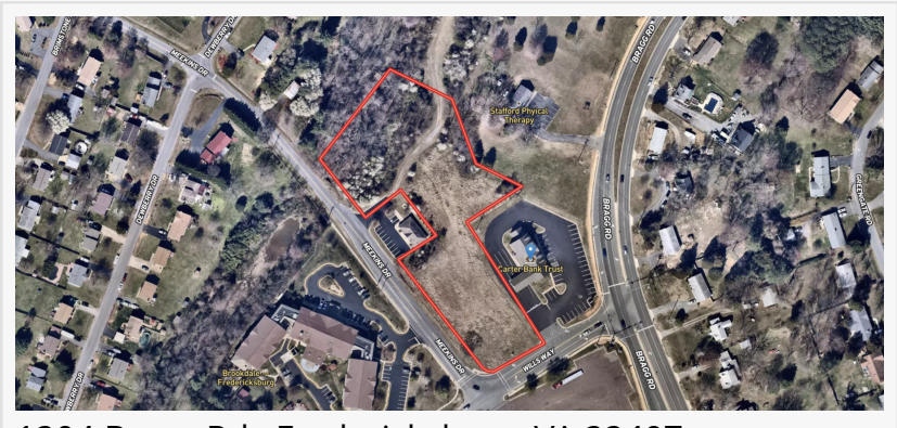
1204 Bragg Rd., Fredericksburg, VA 22407

FREDERICKSBURG, VIRGINIA, UNITED STATES, October 19, 2021 /EINPresswire.com/ -- Nicholls Auction Marketing Group, Inc., (www.nichollsauction.com) announces the online auction of 2.81± acres of commercial zoned property near Rt. 3 <u>& I-95</u> in Fredericksburg, VA -- the online auction is open for bidding but bidding will begin to close on Tuesday, October 26 at 2 PM Eastern according