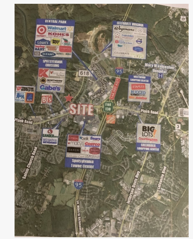
1204 Bragg Rd., Fredericksburg, VA 22407

comprises world and state champion auctioneers, an award winning marketing staff, and sales percentages unmatched in the industry. For more information about Nicholls Auction Marketing Group, Inc., visit <u>www.nichollsauction.com</u> or call 540-898-0971.