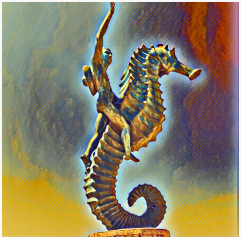
Billionaire NFTs Seahorse

This press release can be viewed online at: https://www.einpresswire.com/article/554269992