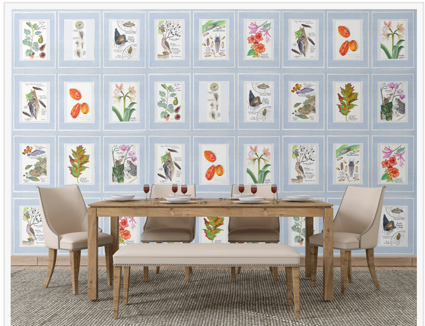
Casart Coverings Nature Noticed Panel 2 Gallery Wall in Dining Room