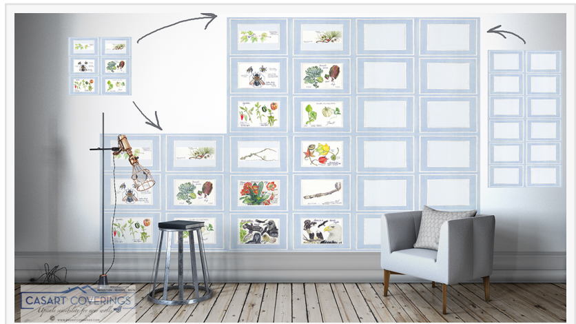
Casart Nature Noticed Panel 1 with movable sections for personalized placement in sitting room

These smaller sections allow the designs to be used in small areas such as bookcase backings and backsplashes or even on a flat door to make it look paneled. There is a lot of flexibility with these Nature Noticed designs. You can create how you want them displayed and can extend the width or the height of a roll with the various sections and sizes in any order you would like to create a full wall or total room coverage.