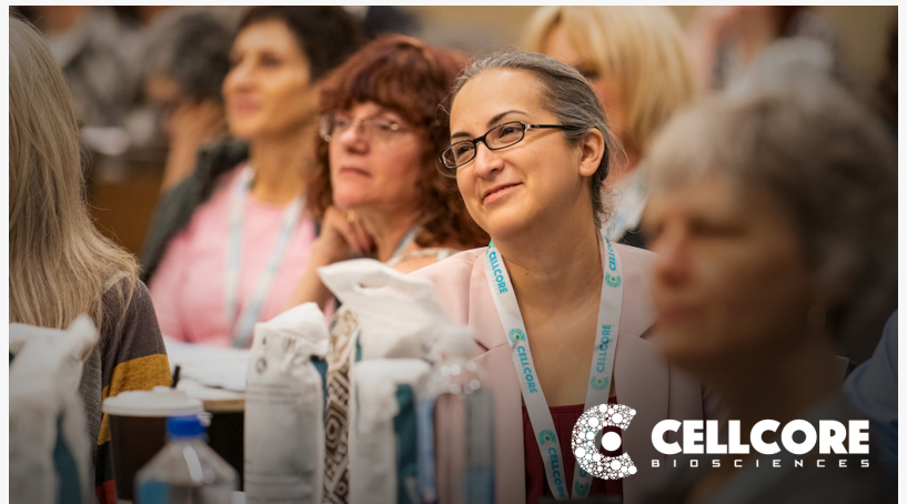
Happy CellCore Conference Audience

MERIDIAN, IDAHO, UNITED STATES, October 20, 2021 /EINPresswire.com/ -- Health company CellCore Biosciences is partnering with the Chiropractic Society of Wisconsin (CSW) as a vendor at their CSW Fall Experience Seminar happening this weekend. From October 22nd through the 24th, chiropractors and their staff are gathering in Wisconsin Dells, WI to earn up to 20 CEUs and learn about everything from chiropractic healthcare models to the gut-brain axis.