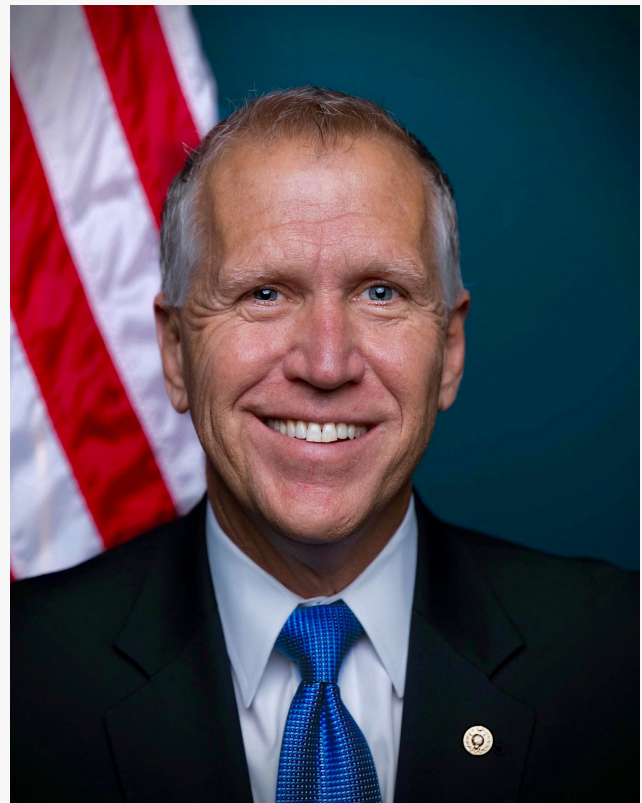
Senator Tillis spoke on religious freedom and security issues around the globe