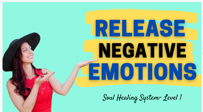
Remove subconscious blocks to live a happy life