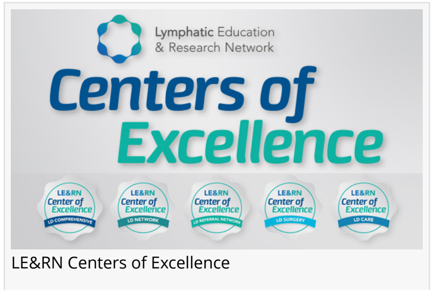
LE&RN Centers of Excellence

NEW YORK, NY, USA, October 21, 2021 /EINPresswire.com/ -- LE&RN has announced five newly designated LE&RN Centers of Excellence in the Diagnosis and Treatment of Lymphatic Diseases . These institutions, in the categories of Network of Excellence, Referral Network of Excellence, and Lymphatic Disease Surgery Centers of Excellence, join existing Centers around the globe.