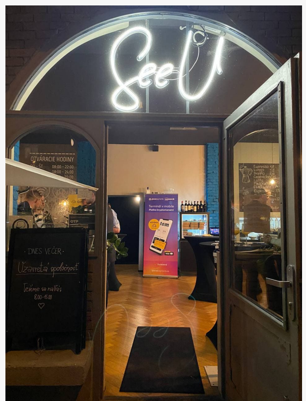
GP tom in Slovakia and Czech Republic

The biggest advantage of the GP tom application is that smaller merchants will no longer need any additional payment terminal hardware; they can simply accept payments on their mobile