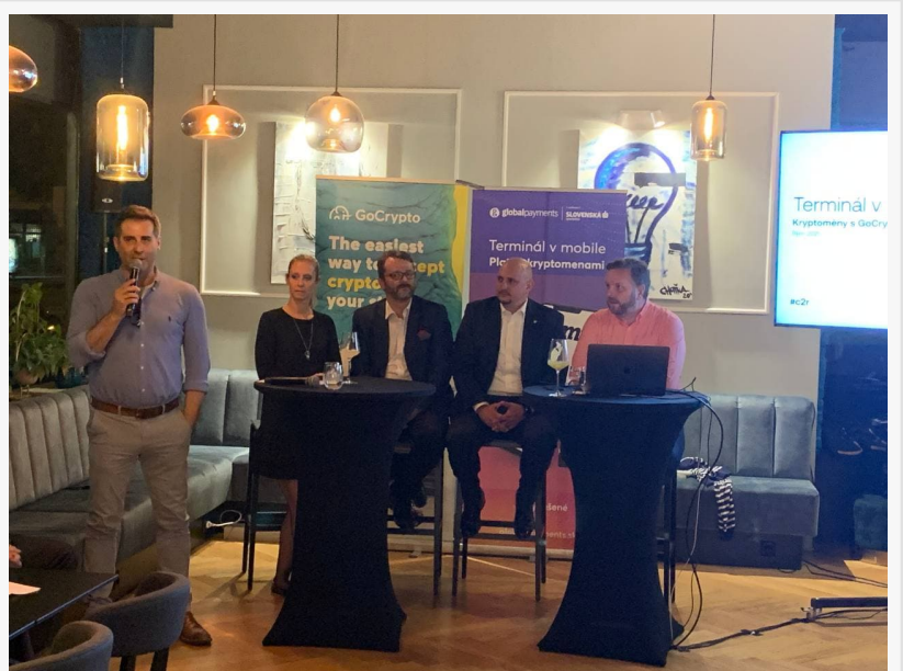
Eminent event presenting GP tom

Created by a team of crypto experts who envisioned the use of crypto in daily shopping, the GoCrypto solution enables merchants to accept instant crypto payments. The merchants have the option to receive settlements exchanged into their local currency or in the supported cryptocurrency of their choice. GoCrypto operates as a global payment scheme connecting crypto users, crypto wallets, crypto exchanges, cryptocurrencies, cash register system providers, payment solution providers and merchants. Currently available in 64 countries, GoCrypto is the world's fastest growing crypto payment network, constantly adding new currencies and wallets, which enables the increasing number of crypto enthusiasts to use crypto in their daily life. GoCrypto currently supports the Bitcoin.com Wallet, Elly Wallet and Binance Pay, enabling shoppers to pay with more than 40 different cryptocurrencies.