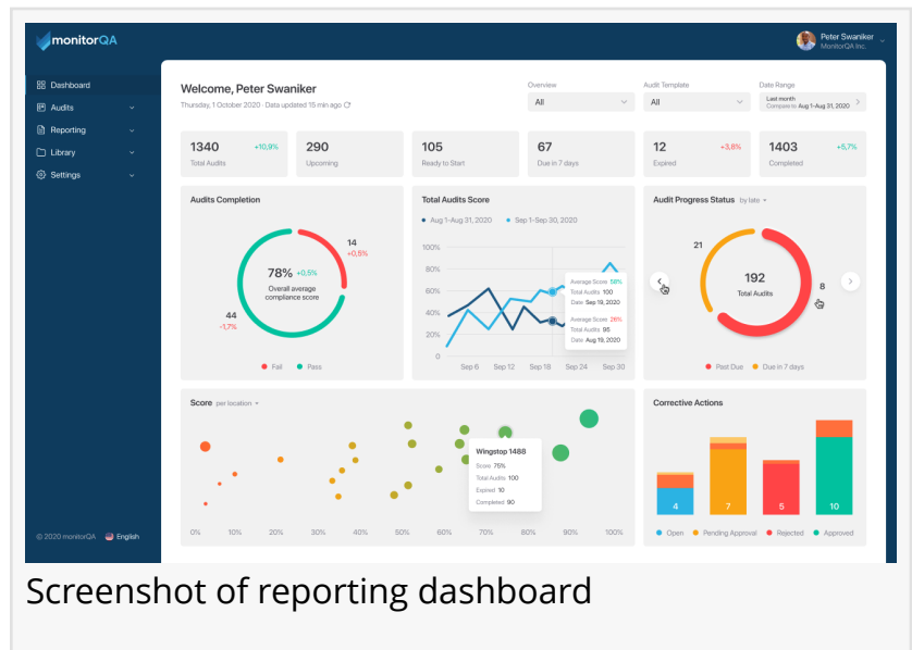
Screenshot of reporting dashboard

dashboard, a mobile inspection app, automated reporting, and a smart audit form builder. In addition to the SaaS Awards, monitorQA's platform was named Product of the Year by Organizational Health & Safety (OH&S) Magazine, and was recognized as one of Software World's top audit management solutions of 2021.