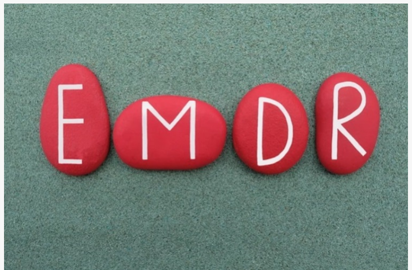
EMDR Therapy Offered by Healthy Families of Albuquerque LLC 505-842-9911

ALBUQUERQUE, NM, UNITED STATES, October 22, 2021 /EINPresswire.com/ -- Healthy Families of Albuquerque, LLC, the leader in therapy, and counseling in Albuquerque, NM, is proud to announce its current counselor totals that specialize in EMDR therapy. The company currently has 13 trained EMDR therapists working with the company.