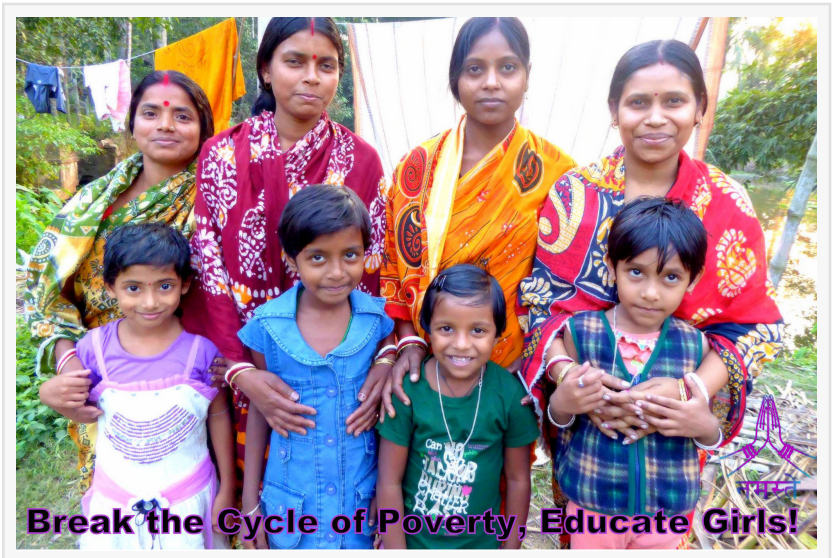
YGB Sister Aid: Today, we are funding nearly 550 mothers in India with our micro loan program and over 1400 children with education.

This press release can be viewed online at: https://www.einpresswire.com/article/554615658