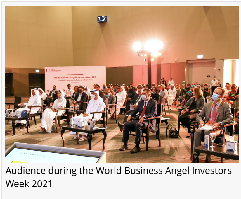
Audience during the World Business Angel Investors Week 2021

As an affiliated partner of the G20 Global Partnership for Financial Inclusion, WBAF coordinates the World Business Angel Investors Week, which was held globally from 18-24 October 2021 and participated in by 72 countries.