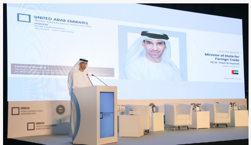
His Excellency Dr. Thani bin Ahmed Al Zeyoudi, Minister of State for Foreign Trade, giving his keynote speech at the World Business Angel Investors Week 2021