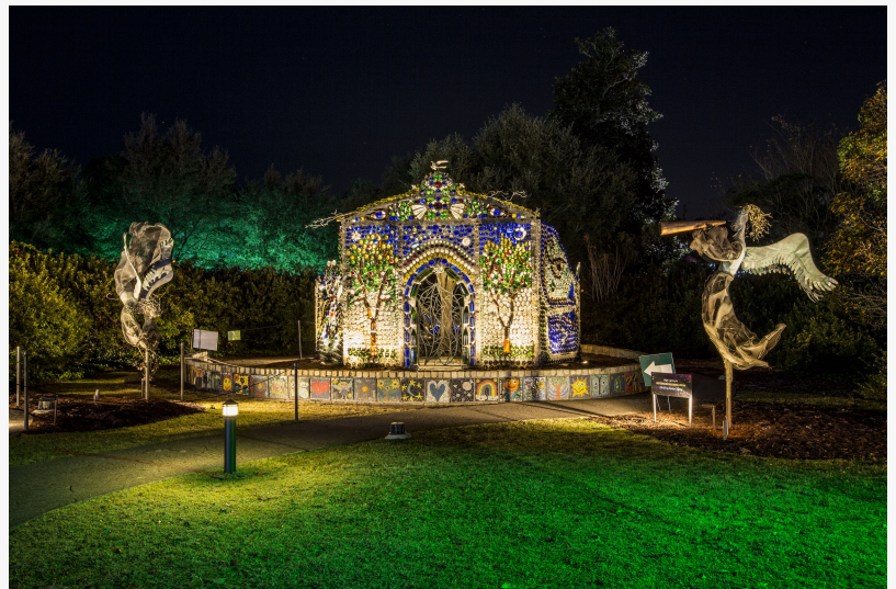
Enchanted Airlie – Courtesy of Airlie Gardens

Centrally located on the parade route, and the official judging site for the Flotilla, host hotel Blockade Runner Beach Resort begins the weekend with a Thanksgiving Day feast. Harbor cruises depart from Blockade Runner to view the Door to Dock holiday lights.