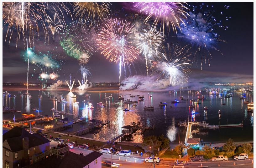
The North Carolina Holiday Flotilla