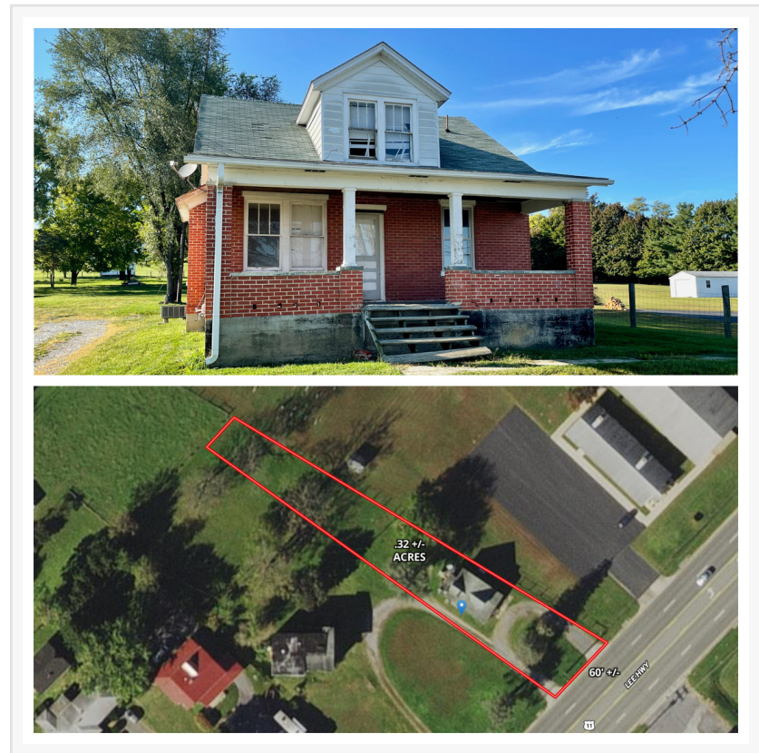
166 Lee Highway, Verona, VA 24482

Nicholls Auction Marketing Group, Inc., with over 50 years of auction superiority and over 200 years of combined experience, has been synonymous with excellence and successfully marketing and selling thousands of properties.