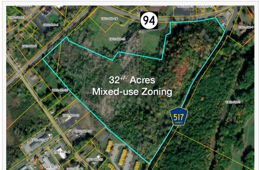
32 Acres to Small Cluster Packages