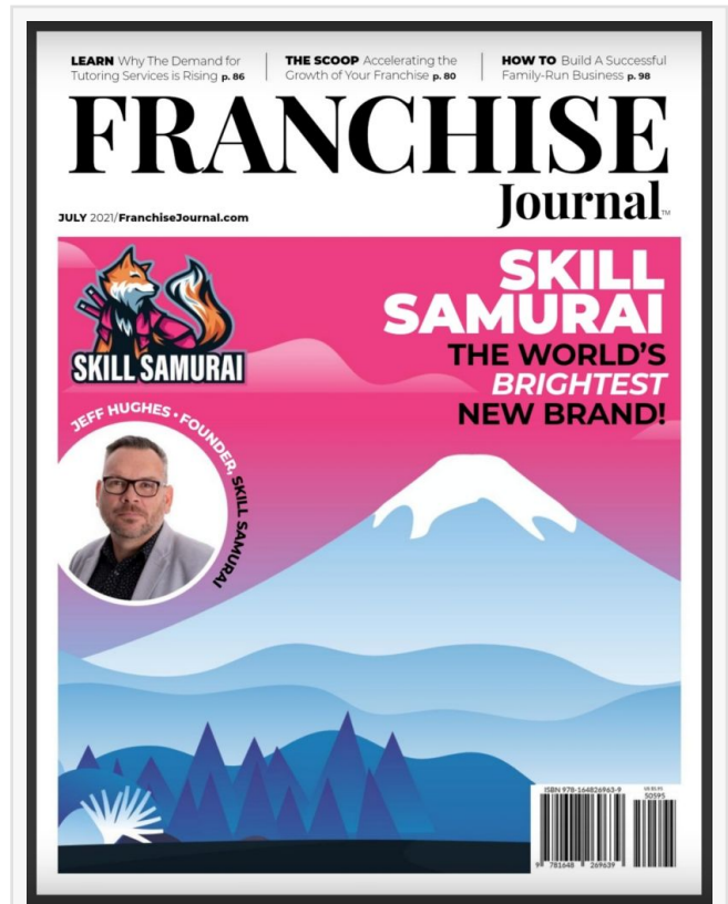
Skill Samurai on the cover of Franchise Journal

We are committed to helping Michigan students launch careers without the burden of student debt. Over the next 5 years we will be opening Skill Samurai Centers in 20+ locations throughout Michigan, starting in the Detroit area.