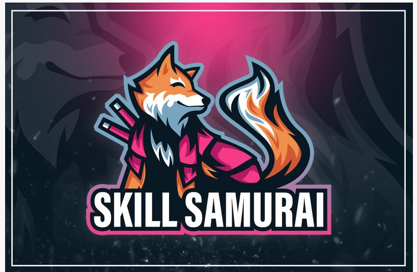
Skill Samurai Logo