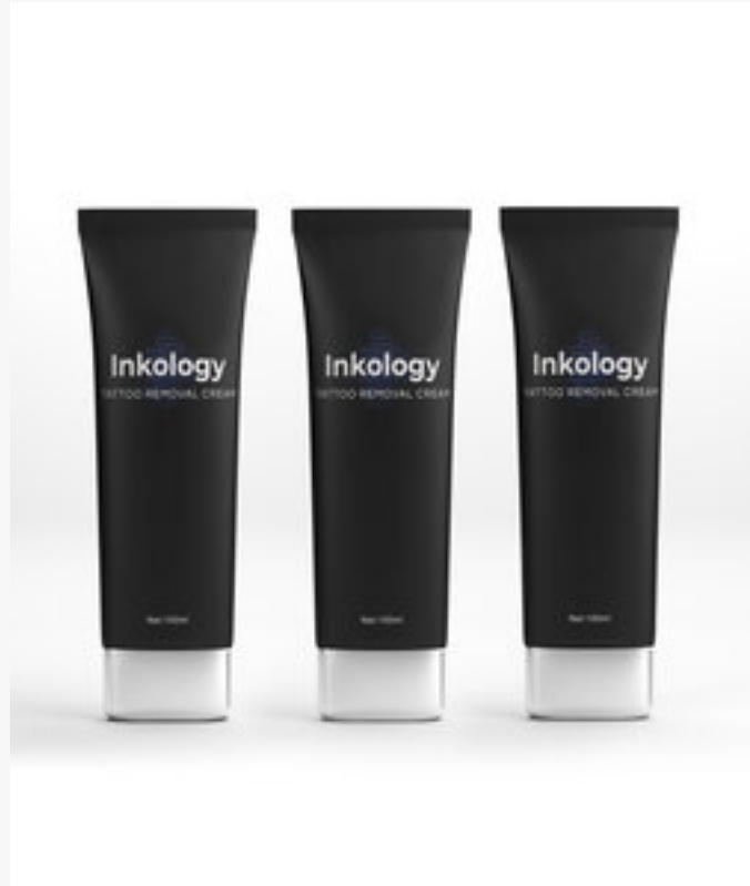
Pain-Free Ink removal