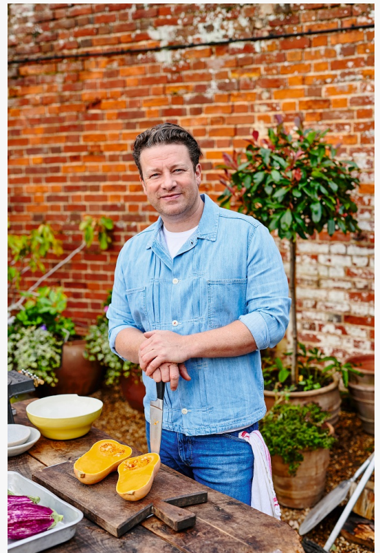
Popular Author and Chef Jamie Oliver discusses his newest book "Together: Memorable Meals Made Easy" with Kate Hudson in Los Angeles next Monday, November 1.

Talking to Oliver will be Kate Hudson, whose breakout role as "band aid" Penny Lane in "Almost Famous" became a career-making performance and earned her a Golden Globe Award and an