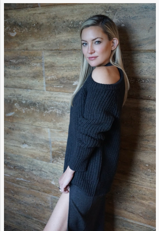
Actress and author Kate Hudson talks to Chef Jamie Oliver about why eating together with family and friends is at the heart of his cookbook.

Adam Horowitz & Michael Diamond (of The Beastie Boys), among many others. LTLA also presents dedicated events featuring chefs in the Live Talks Food & Wine series, and have included Nigella Lawson, Yotam Ottolenghi, and Alice Waters. The Live Talks Business Forum highlights business leaders and has presented such influential figures as Marie Kondo, Tina Brown, and Thomas L. Friedman. The newest offering is Live Talks Newer Voices Series that features notable debut authors, and has included Jade Chang, Lisa Brennan-Jobs, and Scott