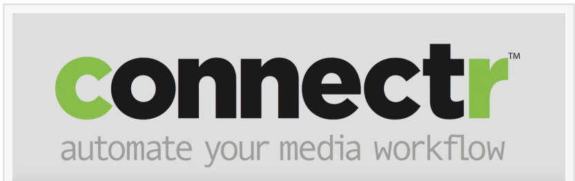
The connectr.ai 2020 logo, by axle ai

"We've been really impressed with how robust and flexible Connectr is, and are already looking forward to taking further advantage of its open systems benefits and almost limitless