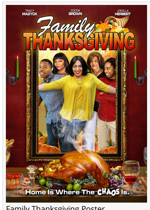
Family Thanksgiving Poster

Says Warren, "I wanted to capture all the emotions of an Black family Thanksgiving gathering—the chaos and drama as well as the joy when they come together