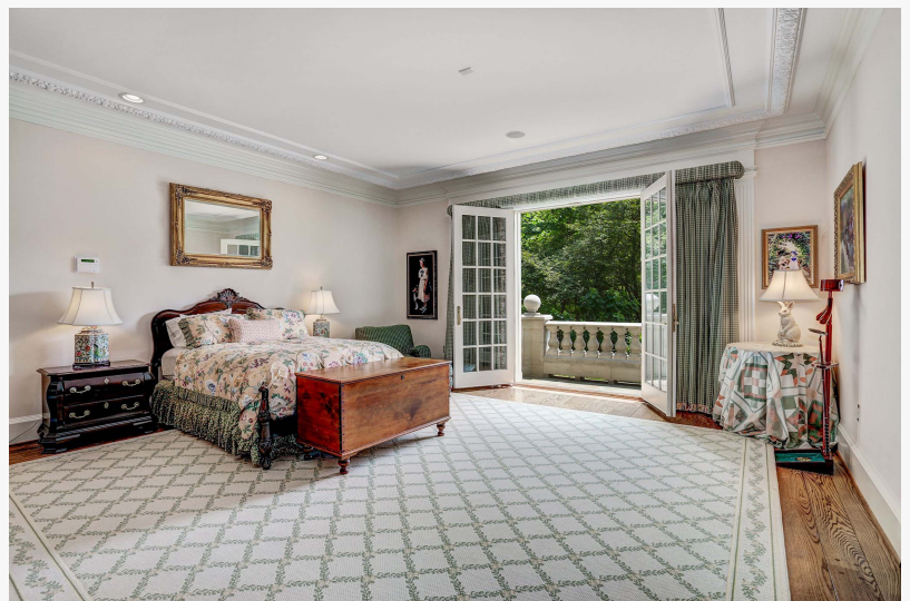
Two decadent owners' suites await from the main and second floors