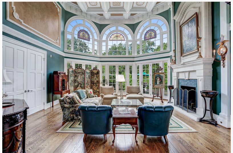
Modern castle constructed with precision craftsmanship