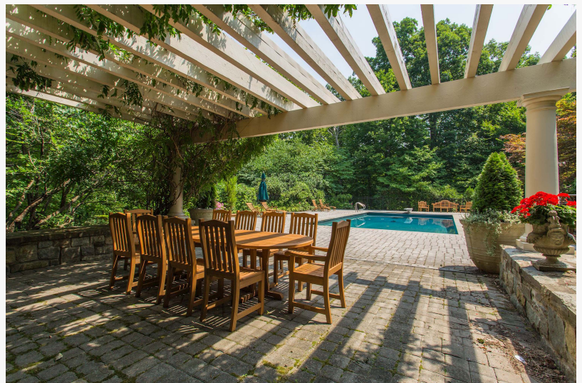
Over five acres of forest and walking paths to a waterfall

This press release can be viewed online at: https://www.einpresswire.com/article/554823854