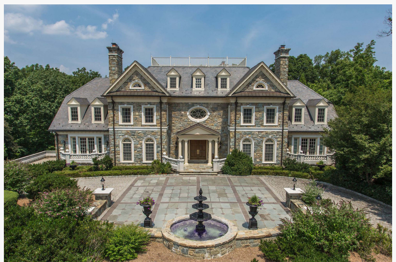
Immaculate Georgian Manor in prestigious McLean