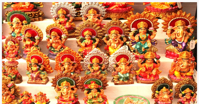
Deities of Ganesh & Lakshmi for Diwali 2021

While folks take the time to give prayers, Diwali is also the most festive time of the year. Celebrations last for 5 days. Temples, homes and offices are cleaned and decorated with lamps, candles and rangolis (floor art with colored powder). Special new clothes, jewelry and accessories are purchased for everyone in the family. Gatherings with food and traditional sweets form the