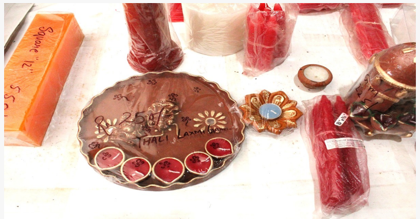
Diyas for Diwali 2021