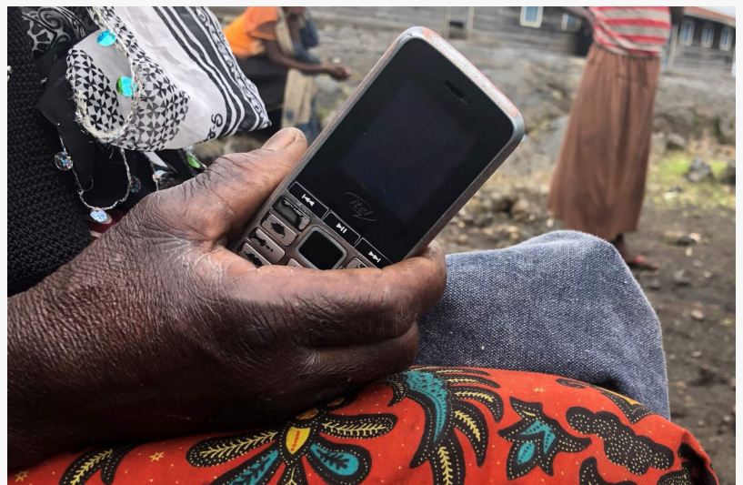
Leaf operates on basic phones- no internet required