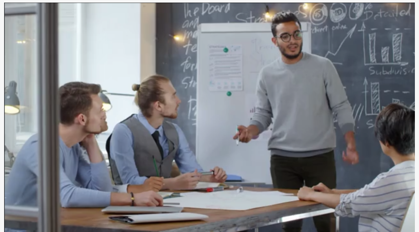
Arlington Health Insurance Agent