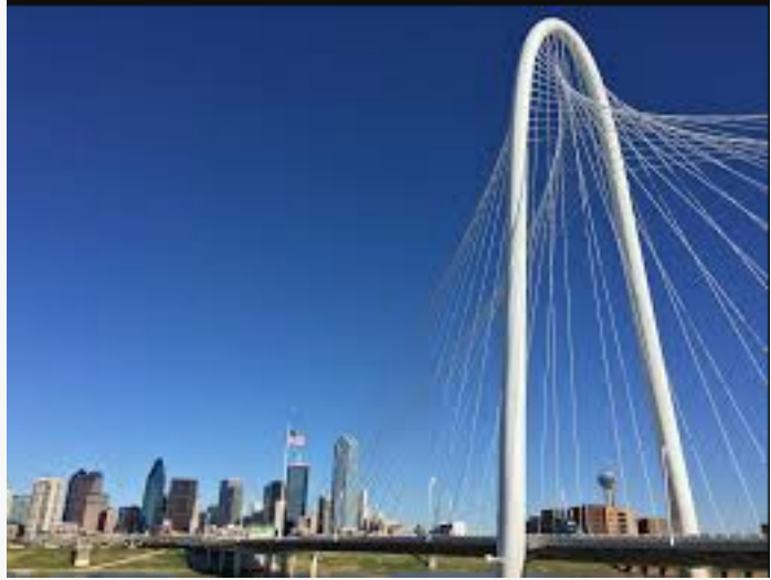
Health Insurance Arlington

Insurance4Dallas 2131 North Collins, Suite 433-517 Arlington, TX 76011