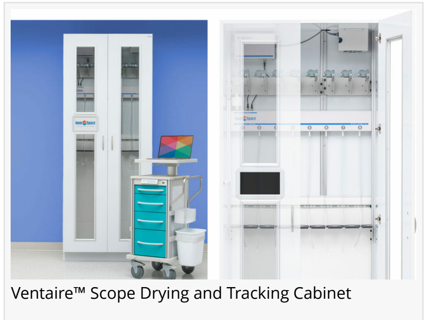
Ventaire™ Scope Drying and Tracking Cabinet

In addition to displaying real-time tracking information like storage durations and expiration times, the Ventaire Scope Drying and Tracking Cabinet generates a report detailing all scope activity.