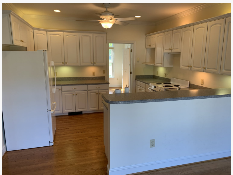
8237 Hickory Drive, King George, VA 22485