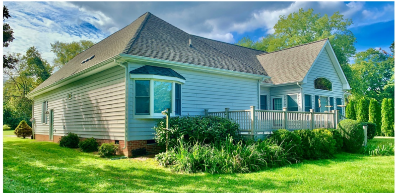
8237 Hickory Drive, King George, VA 22485