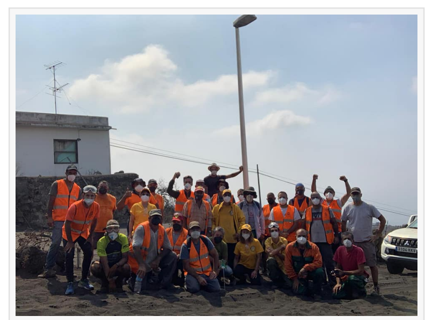
Group Scientology VMs and other volunteers in La Palma

The Cabildo de La Palma has appealed to all the island's residents to create groups of volunteers to help organize and optimize the efforts being made since the volcano erupted on 19