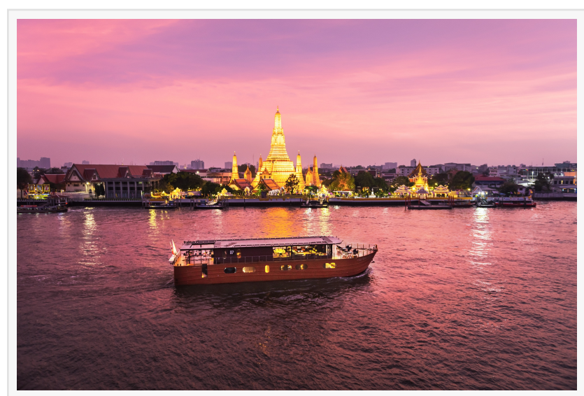
Loy River Song with The Temple of Dawn

Spend an unforgettable night observing Thailand's majestic elephants in their natural habitat from the comfort of your very own, fully furnished, transparent Jungle Bubble at Anantara Golden Triangle Elephant Camp and Resort. Perched on a wooden deck above the forest, the luxurious bubble offers uninterrupted views of Thailand's gentle giants, as well as the stunning starlit sky above. Set to launch in November is the brand-new Family Jungle Bubble accommodating up to eight people.