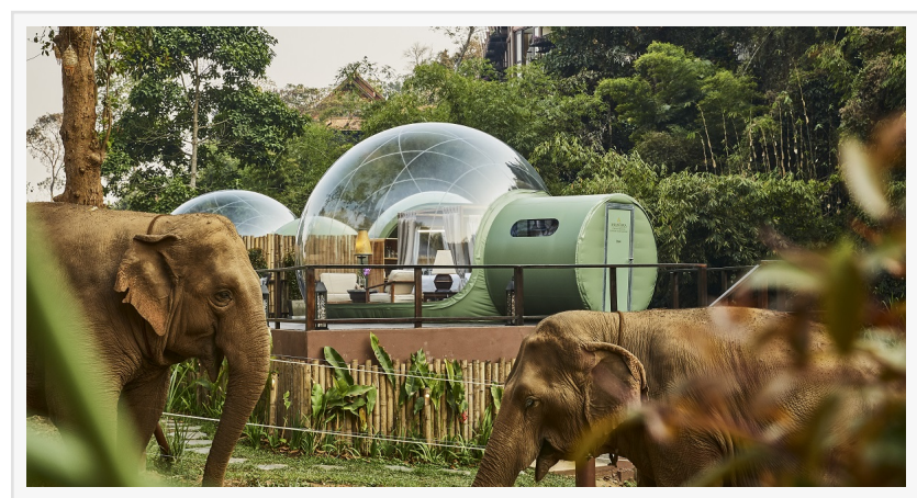
Jungle Bubbles at Anantara Golden Triangle Elephant Camp & Resort

Set to grow over the coming days, the list of "low risk" countries, including Singapore, Germany, China, UK and the US. Tourists will be allowed to visit any part of the country after meeting health and safety requirements upon travel to the country, these include showing that they are Covid-free at the time of travel with an RT-PCR test undertaken prior to departure, followed by a test in Thailand.