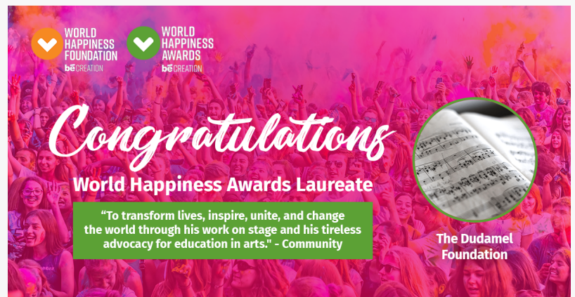
Dudamel Foundation - World Happiness Awards