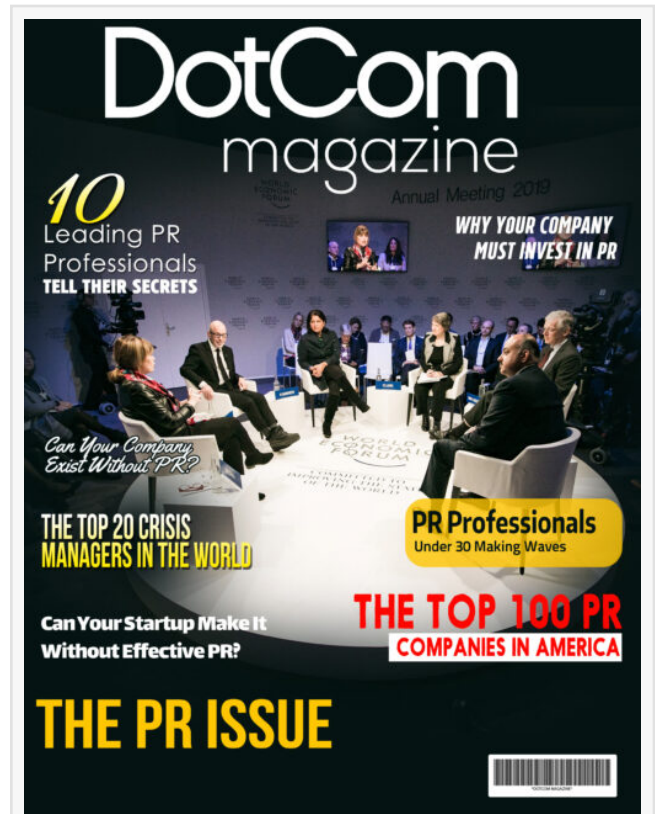
The DotCom Magazine PR Issue