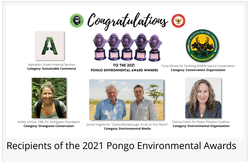
Recipients of the 2021 Pongo Environmental Awards

SANTA MONICA, CA, UNITED STATES, November 2, 2021 /EINPresswire.com/ -- The Orang Utan Republik Foundation (OURF) and actor/environmentalist Ed Begley, Jr. will honor individuals for environmental achievement, green finance, television, advocacy, and orangutan conservation at the 8th Annual Pongo Environmental Awards to be held on Saturday, November 13th at the Indonesian Consulate in Los Angeles.