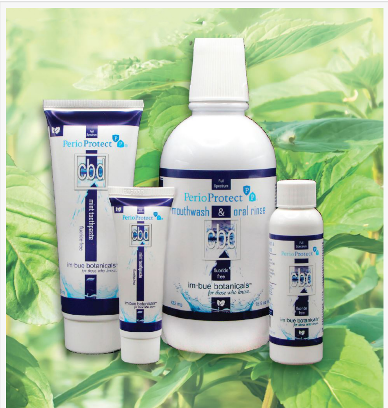
PerioProtect CBD Mouthwash and Toothpaste

PALM SPRINGS, CA, UNITED STATES, November 12, 2021 /EINPresswire.com/ -- Imbue Botanicals, LLC a Wyoming based company, is pleased to announce along with its partners Perio Protect LLC, based in St. Louis, MO and QNT Anderson, LLC, based in Bismarck, ND release of their new CBD Mint Toothpaste and CBD Mint Oral Rinse. A collaborative effort between leaders in the periodontal and compounding pharmacy space that have for years been formulating products that make a positive impact in the management of periodontal disease, and a leader in clinically efficacious CBD products in independent pharmacies, these products are a true step forward in daily oral care.