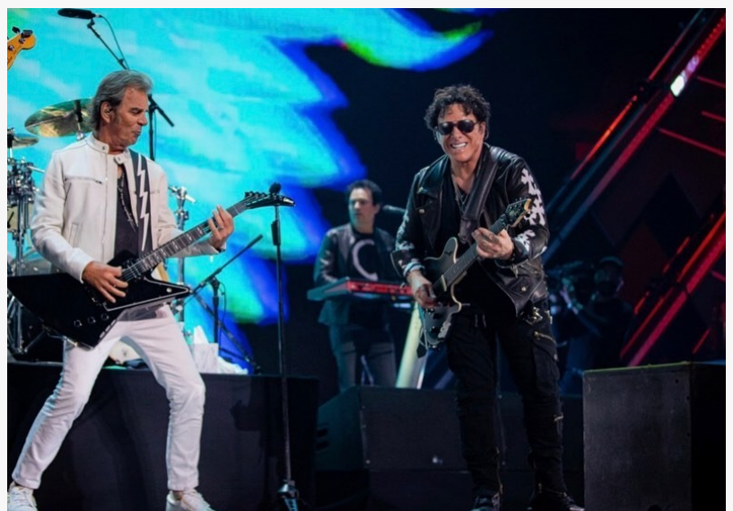
Jonathan Cain and Neal Schon of Journey are pictured during the iHeartRadio Music Festival.

With more solo music, a songwriting event and a Christmas concert to be announced in the near future, Cain, with his band Journey, closed the second and final night of the iHeartRadio Music Festival in Las Vegas Sept. 18 in an iHeart-lauded “epic performance.” Featured this week in the Wall Street Journal, Cain also led worship during the Unleashed Conference hosted by Paula White Ministries (Sept. 30 – Oct. 3).